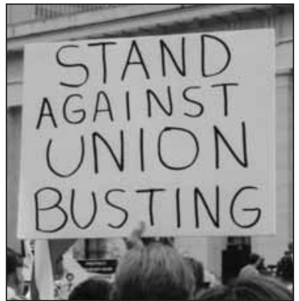
An Ohio voter displayed a sign that conveyed the sentiments of over 60 percent of voters who chose to repeal the anti-worker law.

"In my time as labor secretary, I've seen firsthand time and time again how unions make remarkable contributions to the strength and prosperity of our nation," said Solis. "In workplaces across the country, collective bargaining is helping businesses improve their bottom line, providing tax payers with high-quality services, making workplaces safer and more productive, and ensuring that all Americans have the opportunity to make it into the middle class."