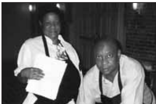
Two members prepare to vote on a recently negotiated agreement.