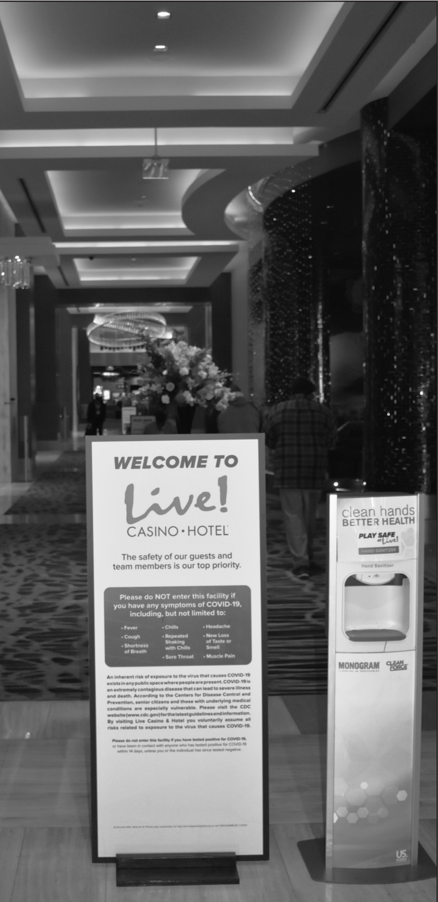
Informational signage and sanitation stations are at every entrance to the hotel and casino.