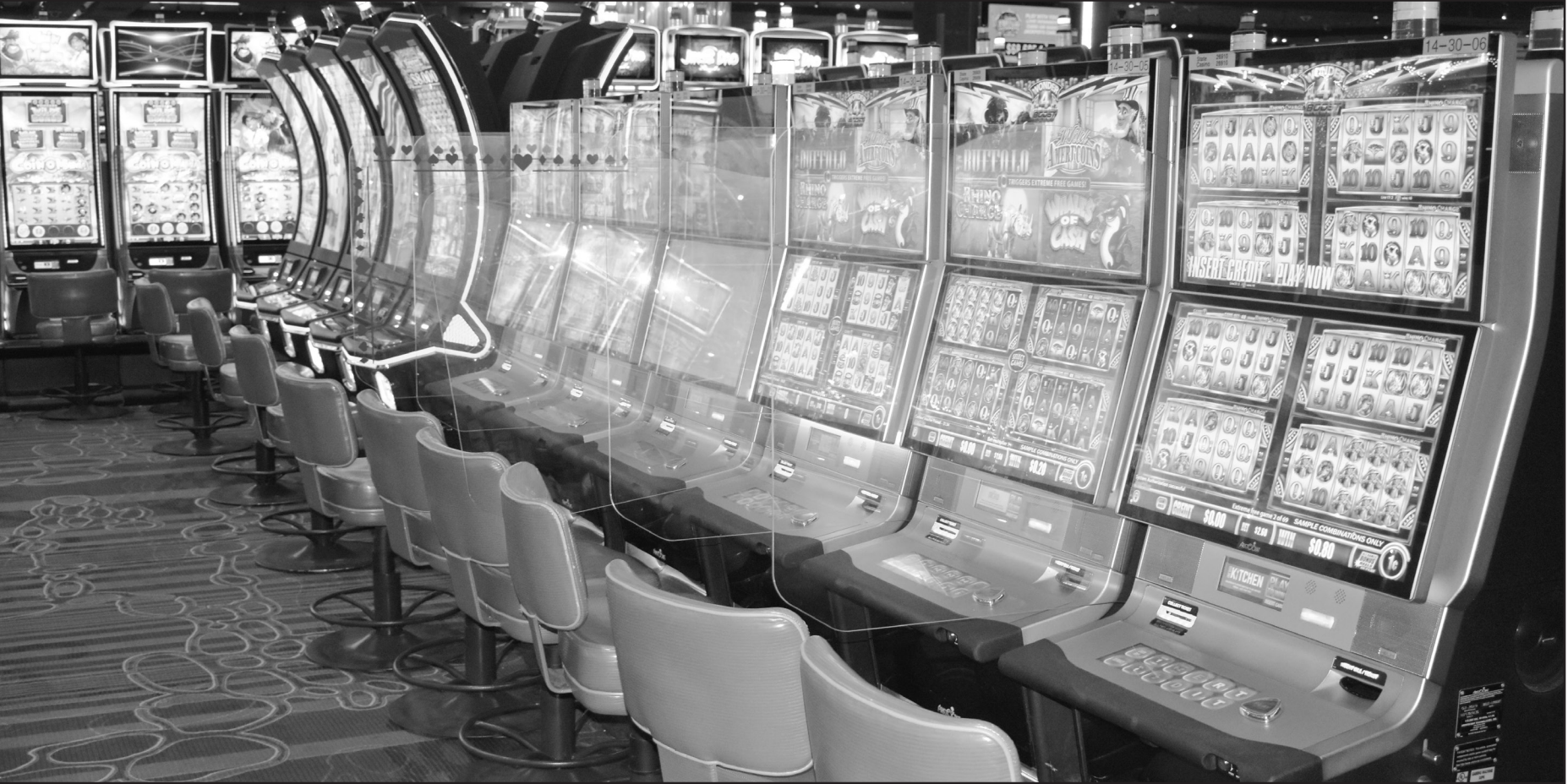
A row of Video Lottery Terminals (VLTs), divided by plastic barriers between each seat. On rows of VLTs without barriers, every other terminal is turned off, to create the necessary separation between patrons.