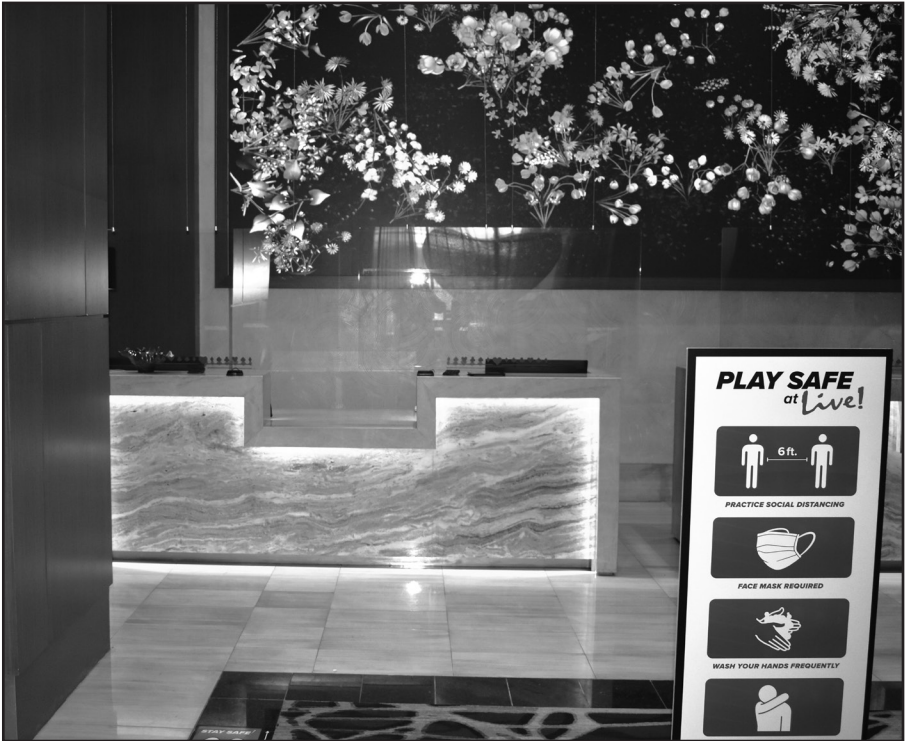
The lobby of the Maryland LIVE! Hotel. Note the plastic barrier covering the length of the check-in desk.