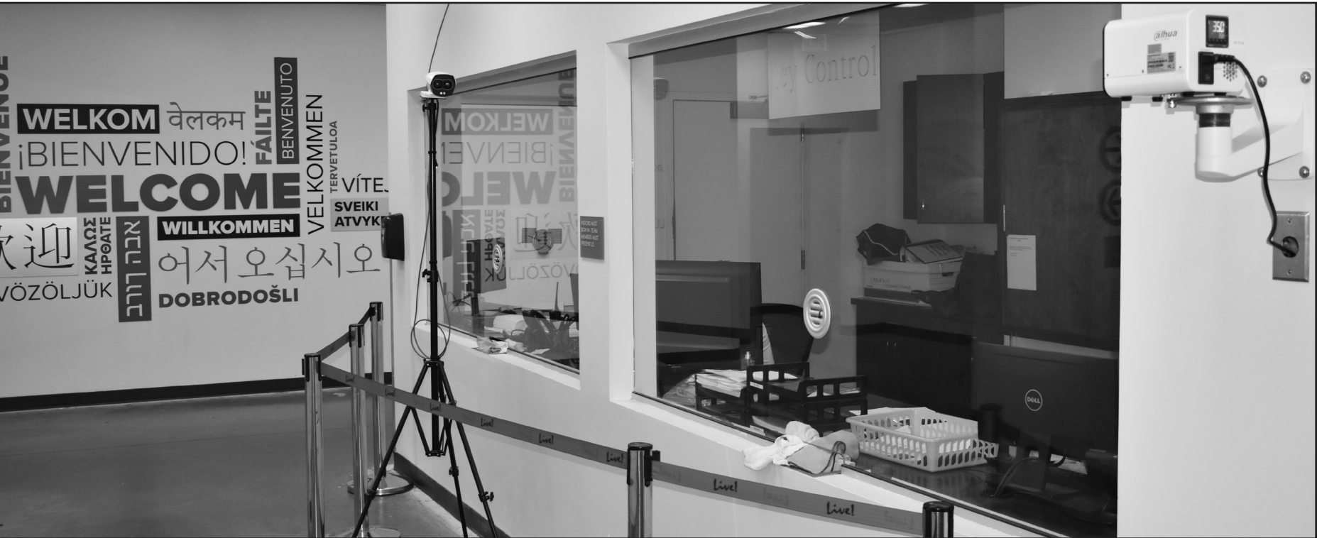
The temporary employee entrance, complete with temperature readers monitored by members of the security team.