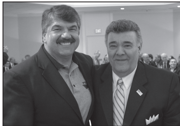
AFL-CIO President Richard Trumka, left, stands with SEATU President Michael Sacco in a 2008 file photo.

"Let me tell you about what happened in Detroit. On Tuesday night, a chaotic scene erupted outside the vote tally room at the TCF Center. Protesters showed up. They harassed and intimidated nonpartisan volunteers who were counting ballots. They screamed "stop the votes" and "stop the counts." The Michigan AFL-CIO put out an email Wednesday at 3 a.m. asking members to show up and protect our democracy. The outpouring of support