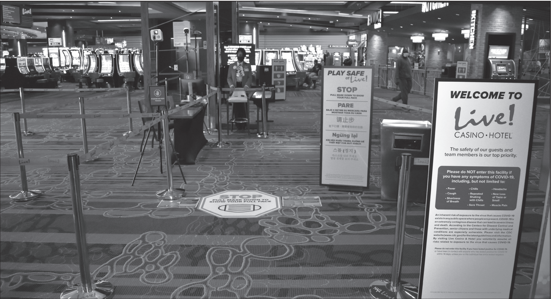
Pictured above, one of the multiple temperature checkpoints at the SEATU-contracted Maryland LIVE! Hotel and Casino in Columbia, Maryland. These safety precautions are just one of the many changes made to help keep both guests and employees safe during the ongoing global pandemic. Additional photos on Pages 4-5.